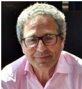
Chair of the Board Hockey Canada 2024